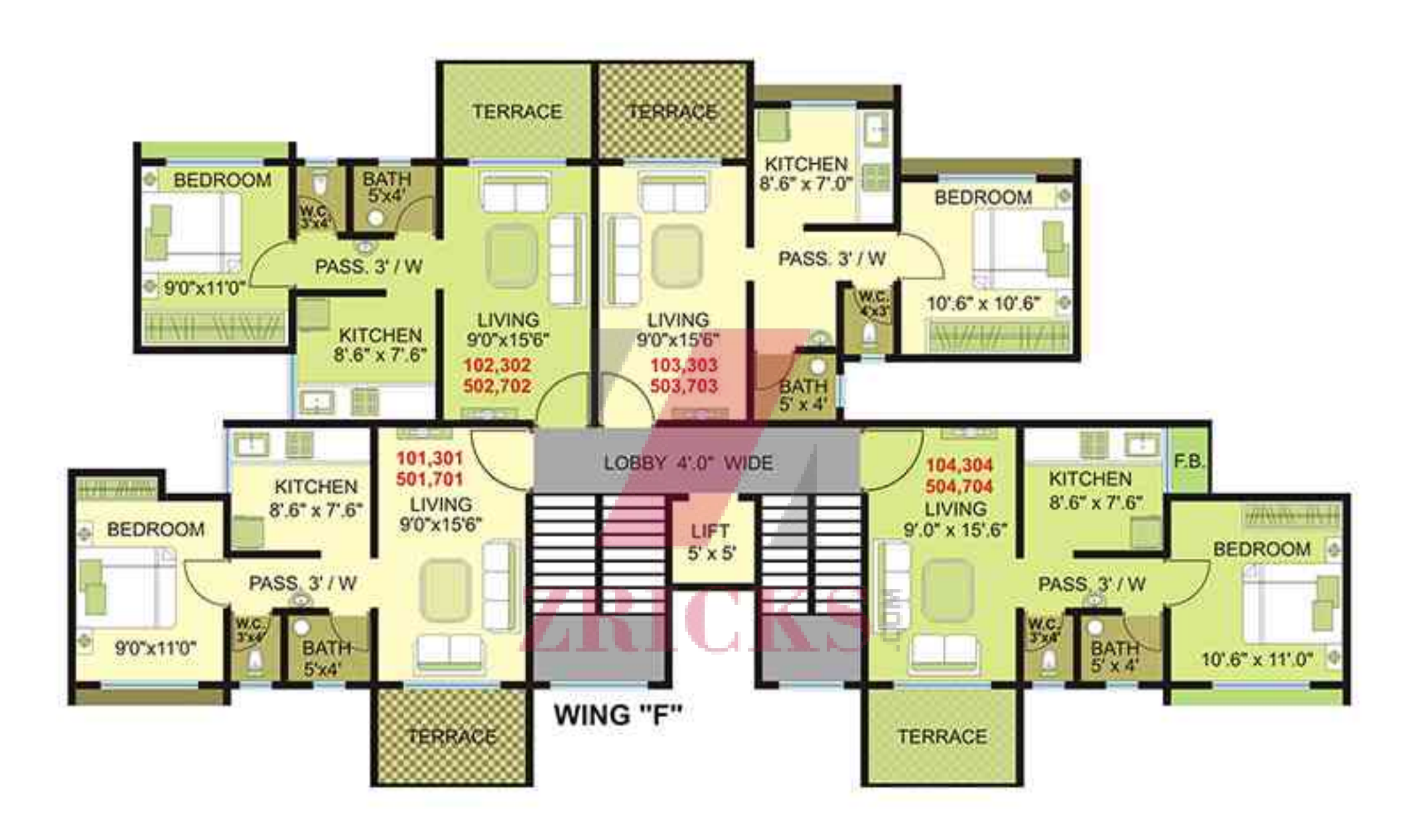
TYPICAL FLOOR PLAN FIRST, THIRD, FIFTH & SEVENTH FLOOR WING - F